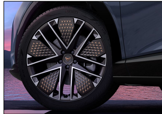
← VZ with optional Extreme Package: 21" ETNA