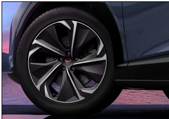
← ENDURANCE with optional Interior Package: 20" HECKLA