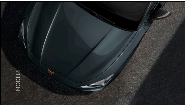
← FIORD BLUE (9K9K)