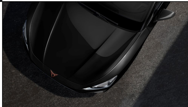
← MIDNIGHT BLACK (OEOE)

The reproduction process does not allow for exact reproduction of the exterior or the upholstery colours. Please contact your CUPRA Agent for further information on colours and upholstery combinations.