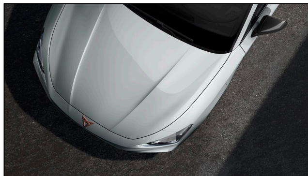
→ GLACIAL WHITE (2Y2Y)