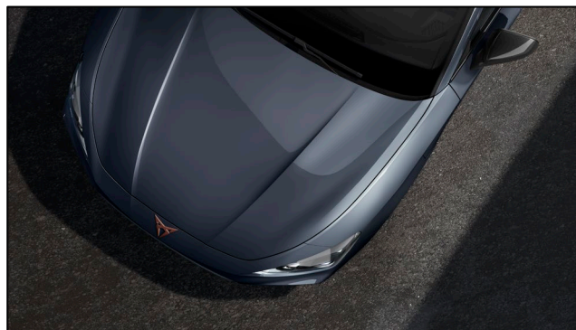
← MAGNETIC TECH (S7S7)