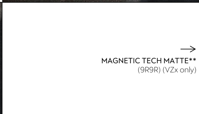
→ MAGNETIC TECH MATTE** (9R9R) (VZx only)