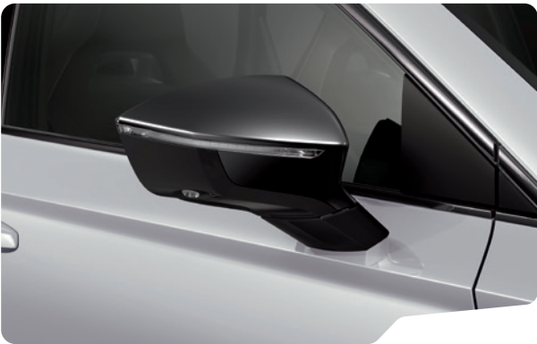
↓ NEVADA WHITE M S