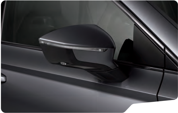
↓ DARK FOREST O